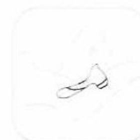
3 INSERT VAGINA