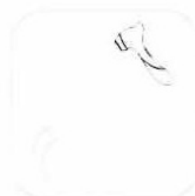
1 SUCKING NIPPLE