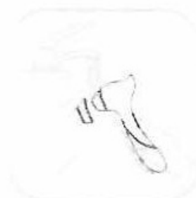
1. OPEN THE HEAD AND RINSE