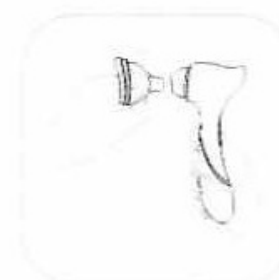
2 DRY WITH A CLOTH AND ASSEMBLE