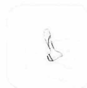
2 SUCKING CLITORIS