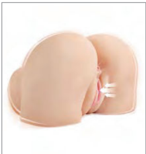
DOGGY STYLE SUCTION!