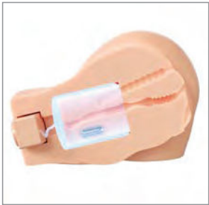
INTERMITTENT SUCTION & VIBRATION